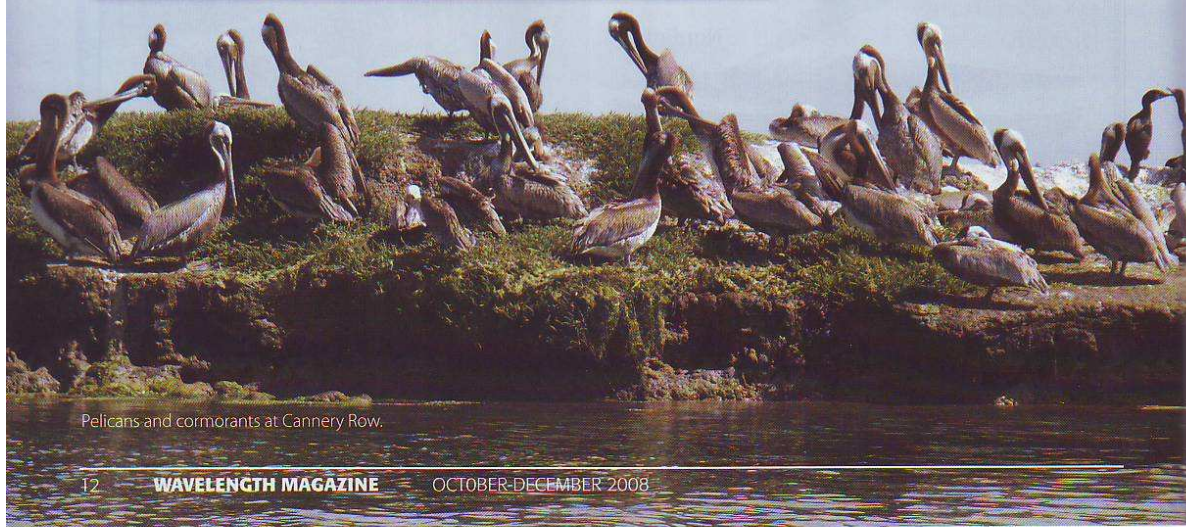
Pelicans and cormorants at Cannery Row.

“Or perhaps hanging out at seal bend and being surrounded by plunge-diving pelicans and terns during a feeding frenzy. I am a wetlands enthusiast; I cannot imagine anywhere else I would want to be, except for other wetland systems.”